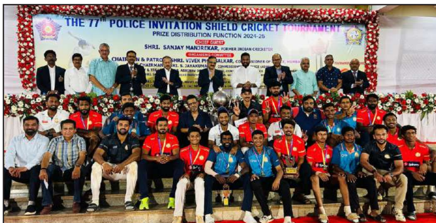
WINNER OF THE 77TH POLICE INVITATION SHIELD CRICKET TOURNAMENT